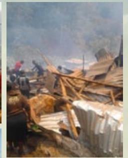
Houses burned down in Deep Sea on 24th September and 460 families were left homeless.