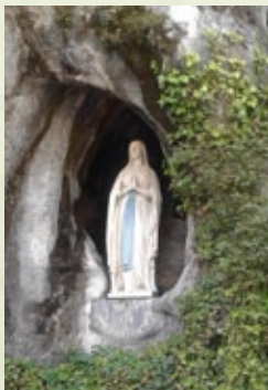
Our Lady of Lourdes, France