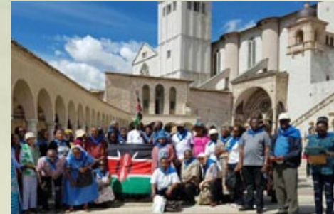
Consolata Shrine pilgrims at St Francis, Assisi, Italy.