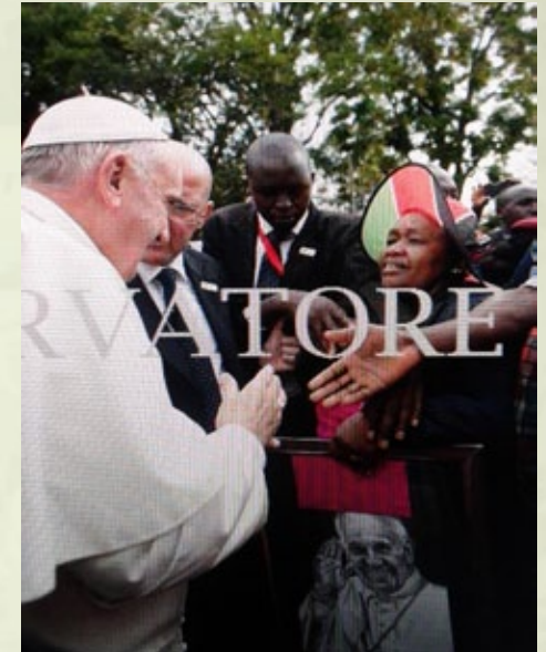
Jane Frances of Consolata Shrine receives Blessings from Pope Francis.

After this, I received overwhelming support in various forms from innumerable people and teams to facilitate immediate commencement of treatment which was lengthy and involved 4 phases. During this period, I joined the Faraja support group at Cancer Care providing me an opportunity to interact with other cancer patients and care-givers. This triggered a desire in me to reach out to other cancer patients who did not have the privilege or energy to join such a support system, birthing my cancer advocacy