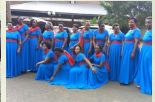
CWA members ready to go for choir competition on Saturday 8th October