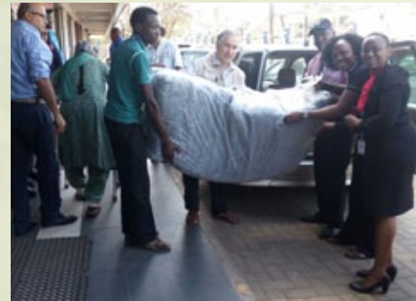
I&M Bank recognizing the work that the Parish is doing in Deep Sea, on 7th October donated 60 blankets for the needy. Thank you!