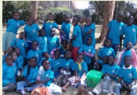
PMC at Conclusions of Missionary Rosary at St Austin's Parish on 9th Oct.