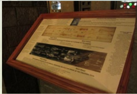
Unveiling of the original replica of the Holy Shroud that is kept in Turin, Italy - 18 September 2016.

During the unveiling Fr. Daniel blessed the replica with Holy Water and Incense. The Holy Shroud replica will provide a source of allowing parishioners to meditate and reflect on what Jesus went through for us, it will also increase our faith for when we see the shroud we know that the Lord rose from the dead to give us eternal life.