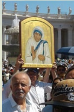
Canonization of Mother Teresa of Calcutta at St Peter's Square, Vatican