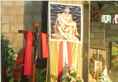
Celebrating the feast of Our Lady of Sorrows - 15 September 2016.