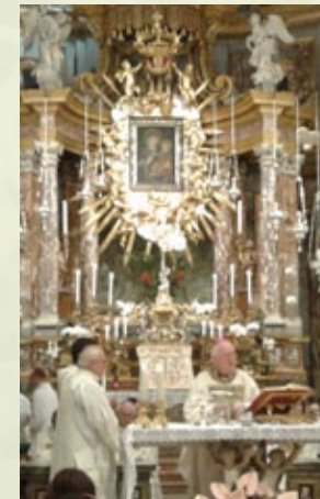
Our Lady Consolata Shrine, Turin, Italy

The pilgrims then travelled to Lourdes in France, where we followed the footsteps of St Bernadette; then we went Spain, visiting Loyola –the land of St Ignatius- and to Avila, – home to St Theresa of Avila. The last part of the