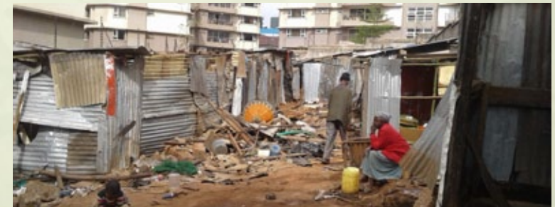
Partial demolition of Maasai Village on 4th October by unknown people. There has been an ongoing court case.