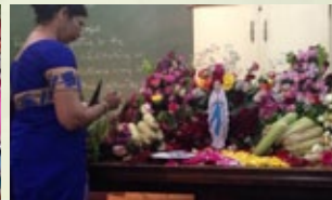
Parishioners celebrated the Feast of the Nativity of Our Lady at Consolata Shrine on 10th September.