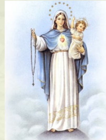
Our Lady of the Holy Rosary

The month of October is dedicated to the Most Holy Rosary. This is primarily due to the fact that the liturgical feast of Our Lady of the Rosary is celebrated annually on October 7. It was instituted to honor the Blessed Virgin Mary in gratitude for the protection that She gives the Church in answer to the praying of the Rosary by the faithful.