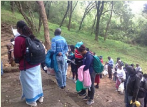
Consolata Shrine parishioners on the Way of Cross at the Subukia Shrine on 20th August.

My soul glorifies the Lord my God. It was the time when I felt the presence of our good Lord through our mother Mary of Subukia. It was my third time to visit that Holy place with the Consolata Shrine parishioners as a